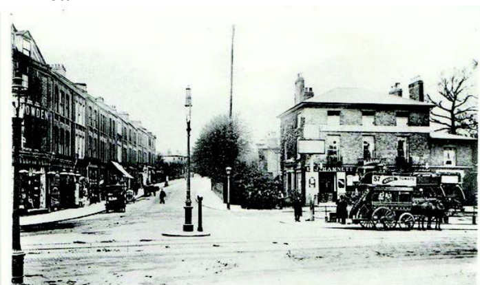
BYGONE WEST NORWOOD Tulse Hill and The Tulse Hill Tavern & Horse Bus Terminal c1905 COLLECTORCARD Craydon CR0 1HW C1574