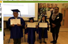
Christchurch Primary School SW2