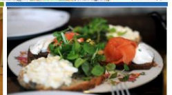
Le Dell Corner Restaurant